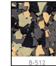
B-512 Black-Brown Mix

BENEFITS: MADE FROM COLORFAST, UV STABLE PIGMENTS...VARIOUS COLORS AND SIZES TO CHOOSE FROM...CAN BE USED AT LIGHT COVERAGE FOR HIGHLIGHTING A COATING OR APPLIED AT FULL COVERAGE FOR MAXIMUM HIDING AND INCREASED TRACTION... CAN BE INTERBLENDED TO COORDINATE THE FLOOR TO ANY WALL DÉCOR... NON-FLAMMABLE...CAN BE USED TO HELP HIDE SUB-SURFACE IMPERFECTIONS