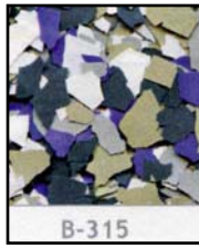
B-315 Gray-Tan Mix