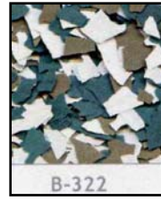
B-322 Green-Tan Mix