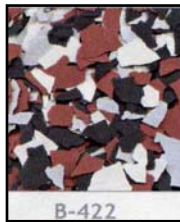
B-422 Red-Brown Mix