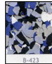
B-423 Blue-Gray Mix