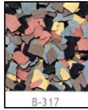
B-317 Brown-Gray Mix