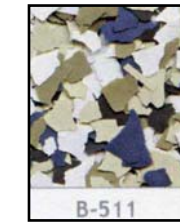
B-511 Brown-Tan Mix