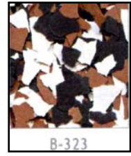
B-323 Brown Mix