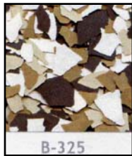
B-325 Brown-Tan Mix