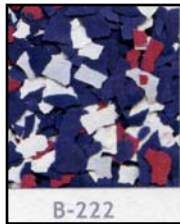
B-222 Blue-Red Mix

PRODUCT DESCRIPTION: Decorative Color Flakes are composed of water-based resin materials, organic minerals, additives and various pigments. The Color Flakes are integrally pigmented, random in shape, and custom blended into various shades to achieve optimal appearance and texture qualities when they are broadcast onto decorative resin-based flooring or wall coating systems. Typical application uses include lobbies, garages floors, industrial hallways, laboratories, schools, retail stores, show rooms, cafeterias, basements, aircraft hangers, hospitals, etc. Specco offers 12 different Color Flake mix options as shown below in the ¼ inch sizing. Custom colors and sizes are available upon request.