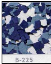
B-225 Blue Mix