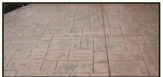
FINISHED AND SEALED