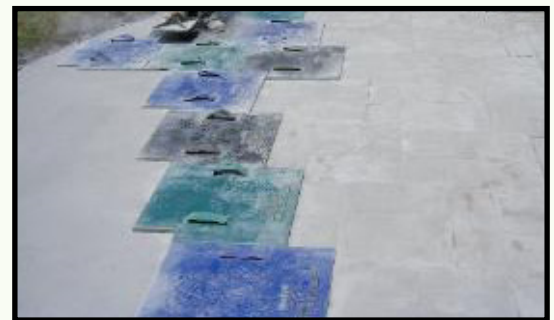
STAMPS AND RELEASE